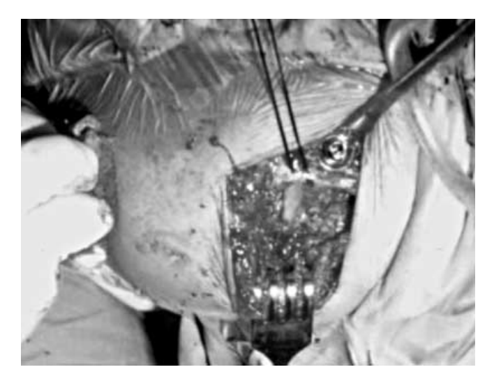
Fig.3 Surgical technique

and narrowing of the joint. Thirteen patients had some calcification between the clavicle and the coracoid process. This calcification did not cause loss of motion or other symptoms in these cases (Table 1).